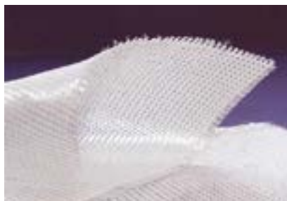
Continuous filament reinforcement

The immense strength of the Zenon Evolution reinforcement means that the finished product is manufactured using significantly less resin than required with traditional reinforcement techniques.