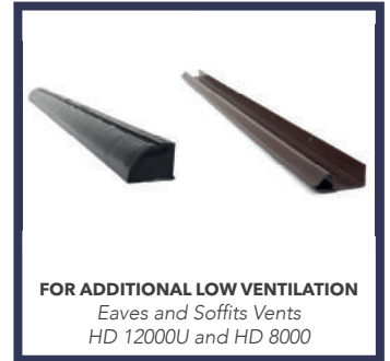
FOR ADDITIONAL LOW VENTILATION Eaves and Soffits Vents HD 12000U and HD 8000