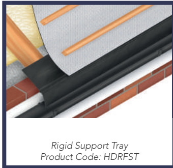
Rigid Support Tray Product Code: HDRFST