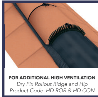
FOR ADDITIONAL HIGH VENTILATION Dry Fix Rollout Ridge and Hip Product Code: HD ROR & HD CON