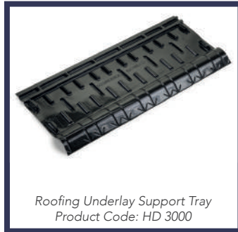
Roofing Underlay Support Tray Product Code: HD 3000