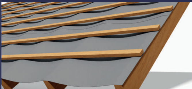
Draped over rafters - cold roof

The simple combination of Danelaw LR breathable roof tile underlay and Danelaw dry fix ventilated ridge system provides an effective and simple solution to comply with the Standards, Building Regulations and NHBC Technical Standards, Chapter 7.2 Pitched roofs.