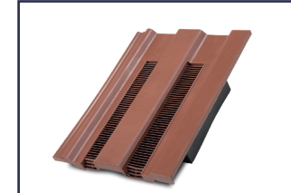
Product code: TV15/4