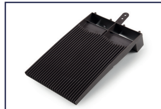
Product code: TV10/5