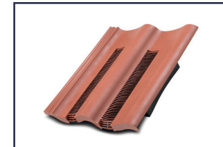
Product code: TV15/2