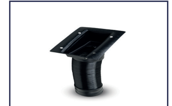
Product code: RSPA