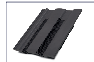
Product code: TV15/7