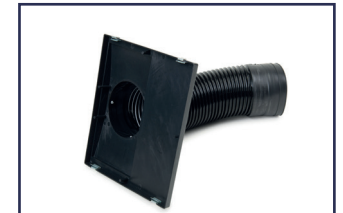
Product code: TVSPA