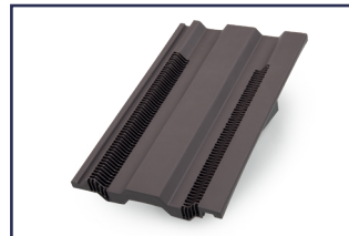
Product code: TV10/6