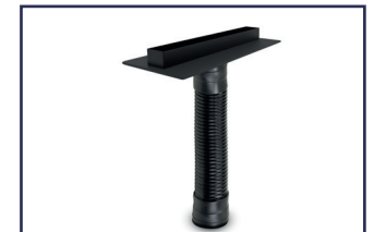
Product code: PCSPA