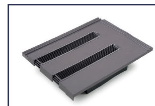
Product code: TV15/1