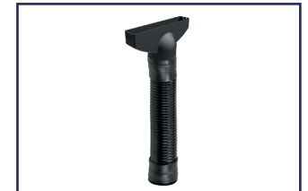
Product code: DPCSPA