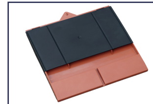
Product code: TV10/9