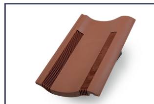
Product code: TV10/8